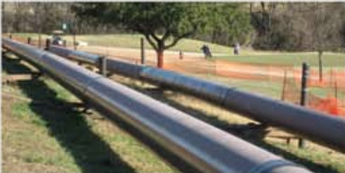
Above: Urban design and construction of 24-inch pipeline, Fort Worth, Texas, U.S.A.